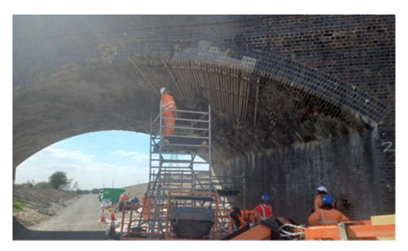
Programme Update – w.c. 25 April 2022